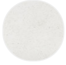
Top - warm white cement